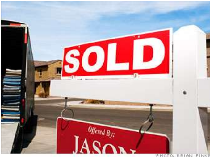
A home off the market in Mesa, Ariz.

The true disaster areas for housing since the bubble burst have been Sunbelt cities such as Las Vegas, Phoenix, and Miami -- places that boasted great job and population growth in the mid-2000s, only to suffer a housing crash that swamped them with empty homes and condos and crushed their economies. But people always want to live in those sunny locales, and their job markets are starting to recover, albeit slowly. In foreclosure markets the inventory problem is far greater because it includes not just traditional resale homes but millions of distressed properties. Fortunately those houses are now such a screaming deal that investors, including lots of mom-and-pop buyers, are purchasing them at a rapid pace. To be sure, some foreclosure markets won't rebound for years because they're both vastly overbuilt and far from big job centers; a prime example is California's Inland Empire, a real estate disaster zone 80 miles east of Los Angeles.