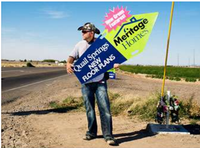
Drumming up sales

Two basic factors are laying the foundation for dramatic recovery in residential real estate. The first is the historic drop in new construction that so amazes Castleman. The second is a steep decline in prices, on the order of 30% nationwide since 2006, and as much as 55% in the hardest-hit markets. The story of this downturn has been an astonishing flight from the traditional American approach of buying new houses to an embrace of renting. But the new affordability will gradually lure Americans back to buying homes. And the return of the homeowner will start raising prices in many markets this year.